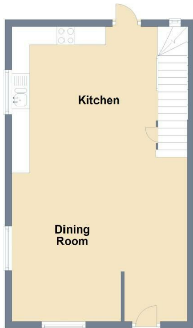
Ground Floor Approx. 40.6 sq. metres (437.5 sq. feet)