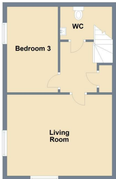
Basement Approx. 38.9 sq. metres (419.0 sq. feet)